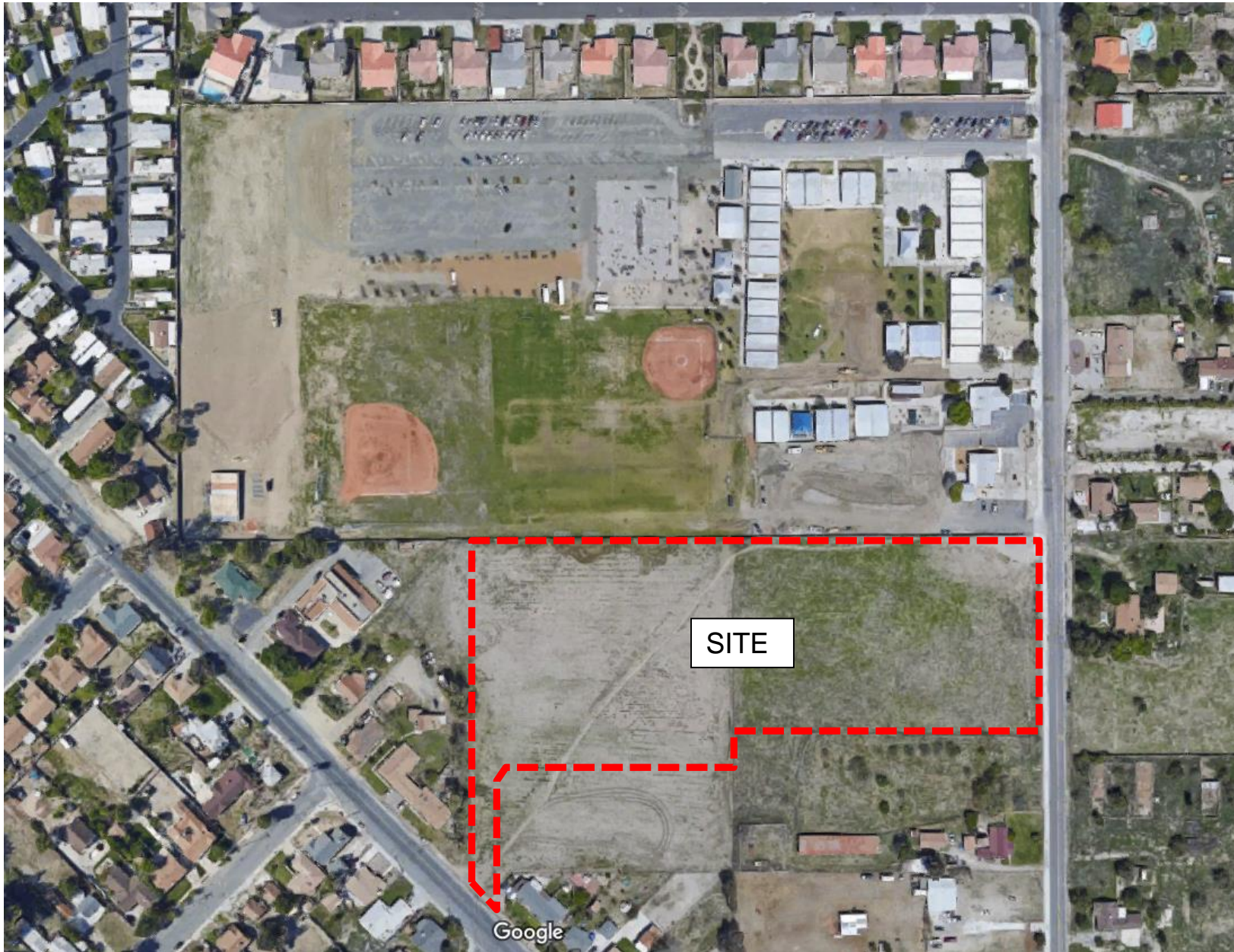
Exhibit A Location Map